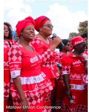
Malawi Union Conference