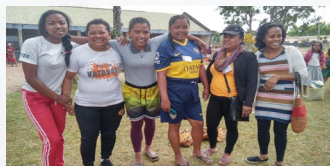
Indian Ocean Union

The theme for this congress was: "Woman armed with strength, God will make you victorious". The five day program included a Carnival in the town, Health Expo program, Food distribution in the prison of Manakara and recreational activity at the beach.