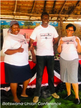
Botswana Union Conference

We pray that through our awareness programmes, THE SILENCE SHALL BE BROKEN.