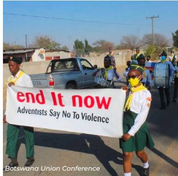
Botswana Union Conference