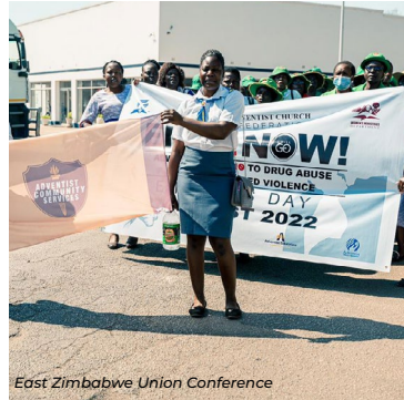
East Zimbabwe Union Conference