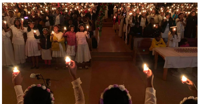
Malagasy Central Conference

“Young girls, radiant, ready to face the future” is the theme that the WM Department of the Malagasy Central Conference chose for the Rally of Young Girls that they conducted in different areas of their territory. More than a thousand girls participated in these events. Different people with different skills offered trainings on many aspects : physical, spiritual, intellectual etc. It was also an opportunity for the girls to renew their commitment to the Lord