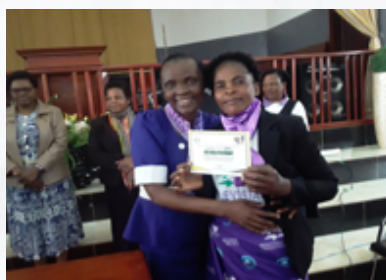
South-Western Angola Union

The South-Western Angola Union hosted a certification seminars in preparing leaders. The Mission Women Ministry department aim is to help each woman to play their role as leaders and to develop positive relationships as members in the Adventist community and the outside community.